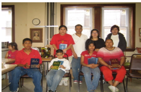
Chicago youth with Spanish Bibles, Prayer Books from Bible, Common Prayer Book Society